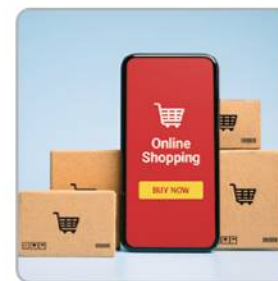
Parcel & Courier