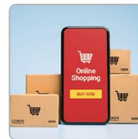
Parcel & Courier