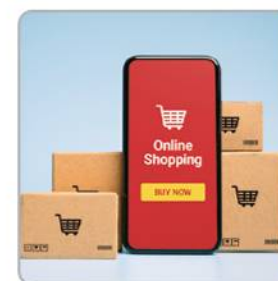
Parcel & Courier