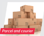
Parcel and courier