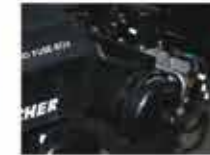
Air processing and distribution assembly for longer life and effective braking