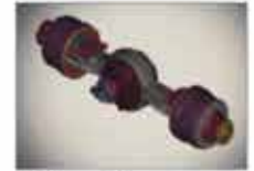
458 mm dia. crown with heavy duty axles