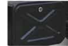
Tool box with lock provision