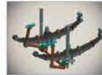
Front suspension with ARB (Anti Roll Bar)