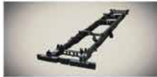
Wider joggled frame Domex chassis with high tensile strength