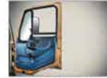
Wider door opening