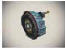
395mm dia. clutch with clutch booster