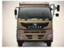
Aerodynamic cabin with new and modern styling