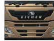
Bigger and stylish integrated headlamps with more light intensity