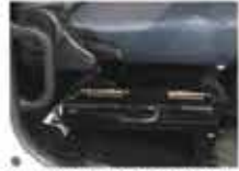
6 way adjustable driver seat