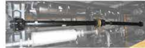
Lubricated for life propeller shaft