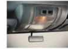
Bigger and stylish room lamp