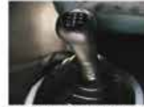
Ergonomically designed gear lever position