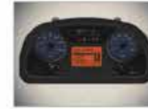
Instrument cluster with LCD display