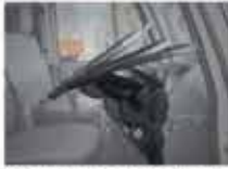
Tilt & telescopic steering