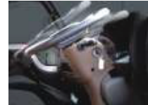
Tilttable and telescopic steering wheel