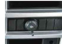
12V mobile charger with multi point charger