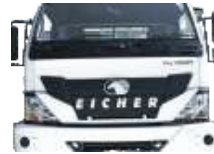
Cabin with new and modern styling