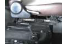
Ergonomically designed 4 way adjustable and comfortable seat