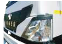
Clear lens integrated headlamps with fog lamps