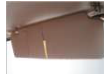
Paper holder in sun visor