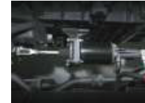
Clutch booster for easy operation of clutch