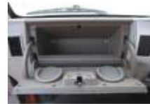
Lockable glove box with tray