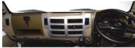
Modern dual tone instrument panel