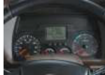
Digital instrument panel