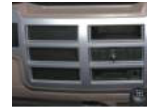
6 din multi-utility dashboard