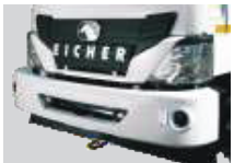
Bigger metallic bumper