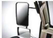
Dual stage mirror