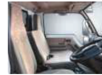
Beige interiors for premium feel