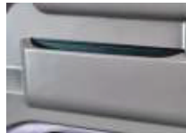
Easily accessible door trim pockets