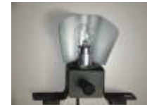
Engine inspection lamp