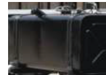
Anti-corrosion fuel tank