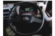
Soft grip steering wheel (PU material)