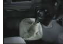
Ergonomically designed hybrid gear shift lever