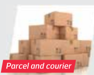
Parcel and courier