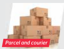
Parcel and courier