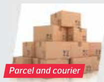
Parcel and courier